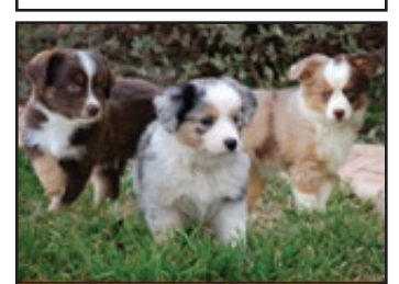
MINI AND TOY AUSSIES

Raising Aussies for 3 Generations Ranch Raised, Socialized & Great Traveling Buddies