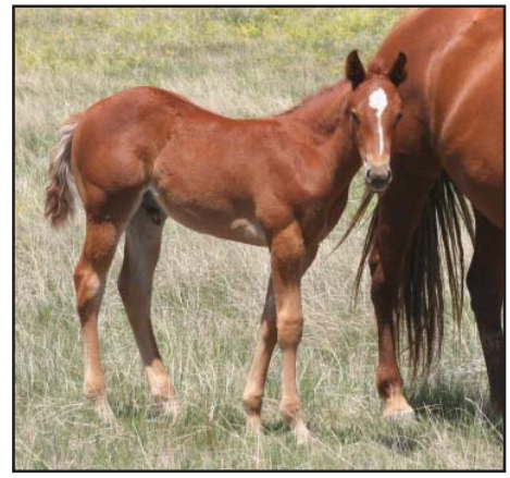
Colt by CM Dynamite Frost-CM Lenas Classy, owned by Crago Quarter Horses, Belle Fourche, SD