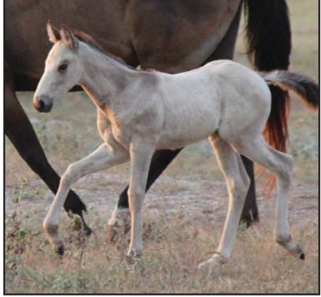
Colt by Devil On A High-daugher of Mr. Master Bug, owned by Lightning T Ranch in Riviera, TX