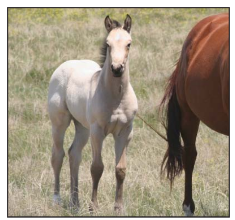
Filly by PC Bronsin-CM Special Shake, owned by Crago Quarter Horses, Belle Fourche, SD