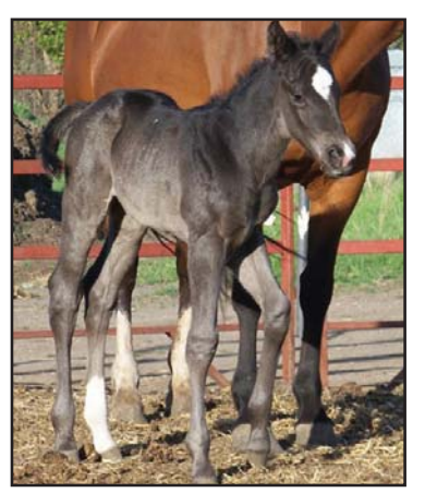
Week old Colt by Rope With Speed-JT Feature Me, Frosty Feature owned by Lyle Wilen, Bismarck, ND