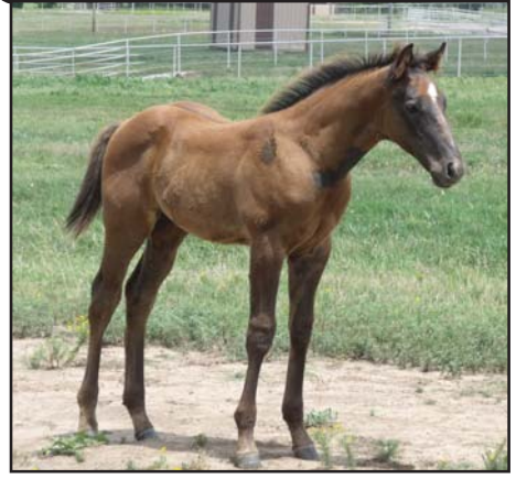
4/18 Colt By Vabellez-Trouble Hutt, owned by LLP Horse Farm Seminole, OK