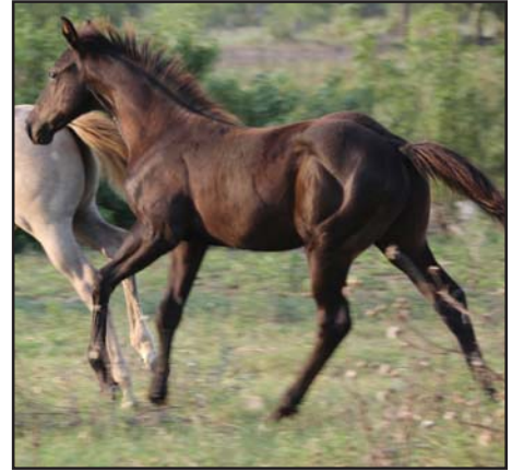
Colt by Time For A God-Daughter of Agony And Ecstasy, owned by LightningT Ranch, Riviera, TX