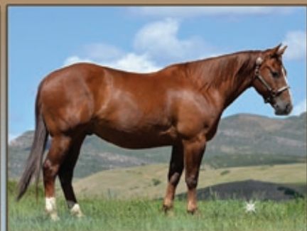
#16 PEPPY SUN O LENA

(Four Roan Fly - Playboys Crown, by Playboys Buck Fever)