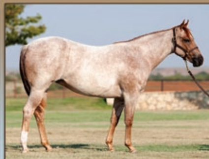
#7 FLY FOR THE CROWN

(PC Frenchmans Hayday - A Smart Little Gal, by Smart Little Lena)