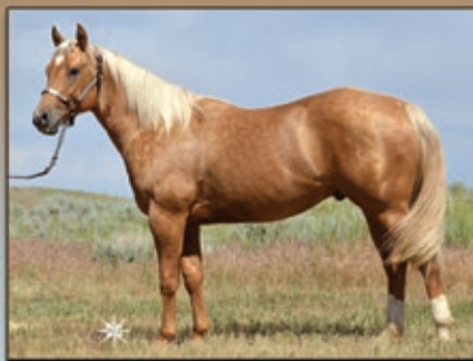
#36 JUST A LITTLE HAYDAY

Catalog Available on-line or can be requested at www.wagonhound.com