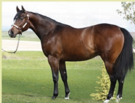
Talented Firewater (2012 Gelding)

Prime TalentxZanas Firewater by Fire Water Flit