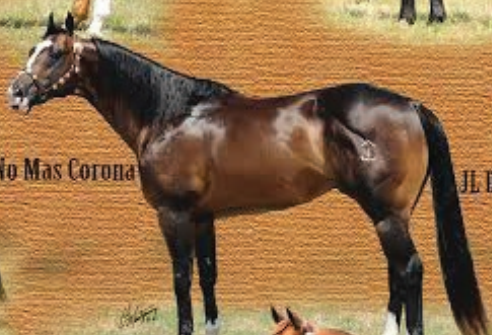
No Mas Corona