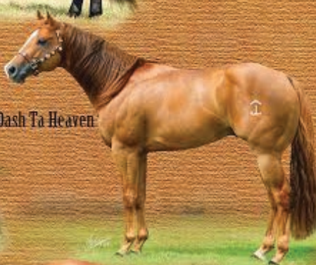
JI Dash Ta Heaven