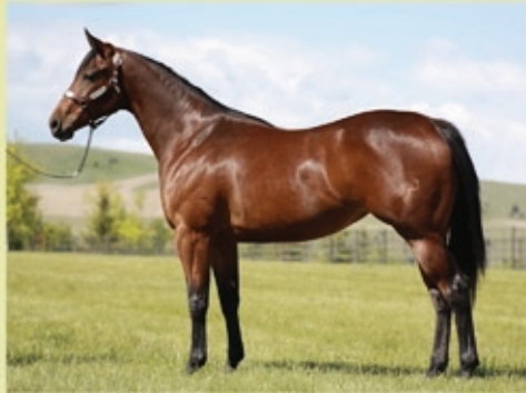
Seriously Talented (2012 Mare)

Prime TalentxBetta Takeme Serious by Frenchmans Guy