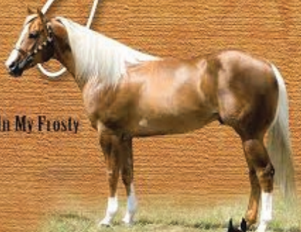
Bug In My Frosty