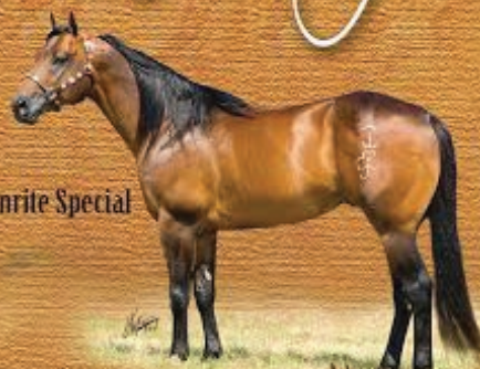
Hes Downrite Special