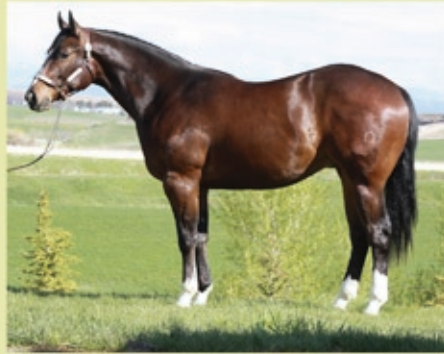
Talent Going On (2012 Gelding)