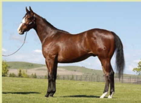
Teasing The Talent (2012 Gelding)